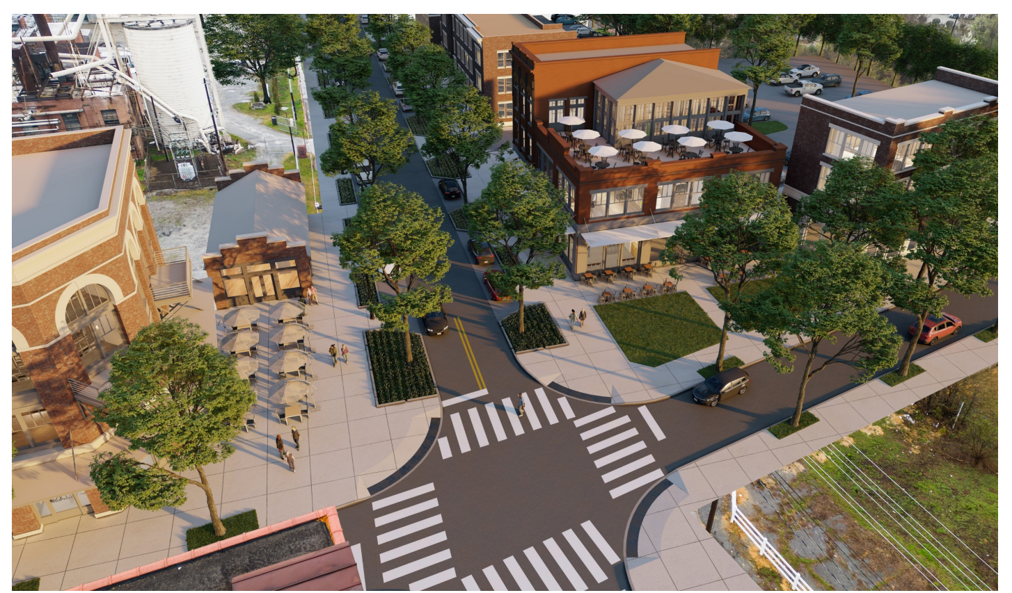
ABOVE: Potential improvements to the intersection of W Green Drive and W Grimes Drive to create more walkable streets with improved pedestrian safety.