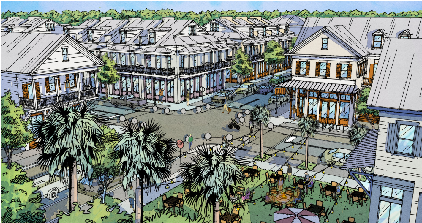
Below: Rendering of potential Hilton Head Island Port Royal Town Center development scenario.

This work was done for the Town of Hilton Head Island as a sub-consultant to MKSK.