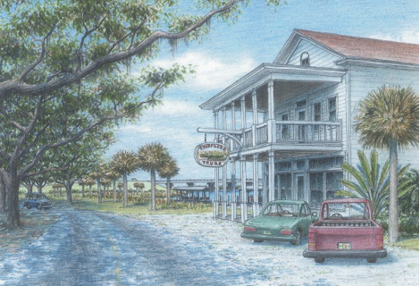
Design techniques meet growth demands while maintaining rural character.