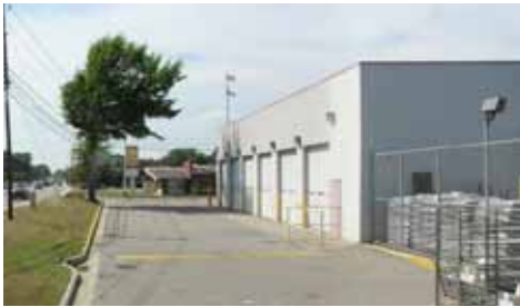
Existing Conditions: The blank walls of Jean Ribaut Square front Boundary Street.

For more information, visit doverkohl.com .