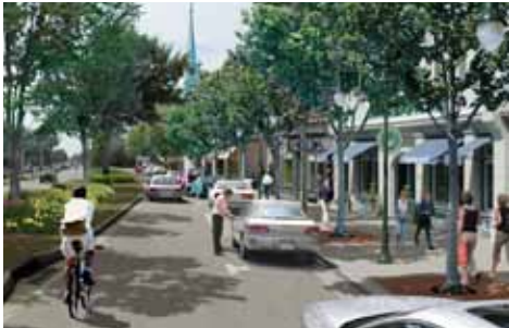
End Result: Overhead utility wires are removed; the street geometry is reconfigured to accommodate a center median green strip, sidewalk, and frontage road with parallel parking on the north side. Street trees and landscaping are added while Jean Ribaut Square adds vibrant, mixed-use buildings to address the street. New buildings and street trees also create a walkable environment along the north side of Boundary Street.