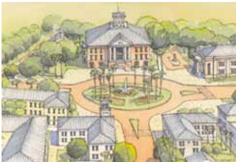
The new City Hall at the intersection of Boundary Street and Ribaut Road can become a formal entrance to Beaufort.