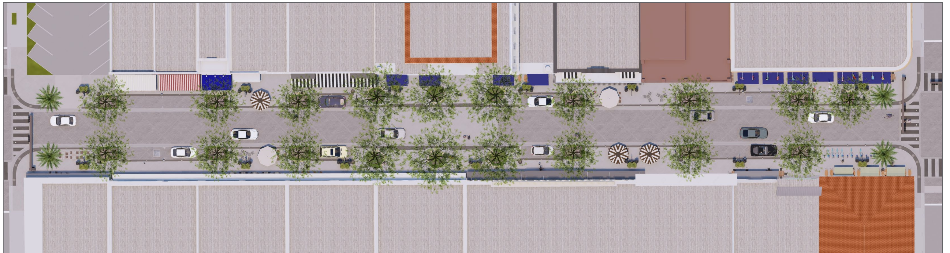
Design in Construction - Curbless Street with Shade Trees, Wide Walkways, Narrowed Traffic Lanes, & Additional Outdoor Dining and Seating. 12 Parking Spaces, 24 Live Oaks/Shade Trees, 4 Palms