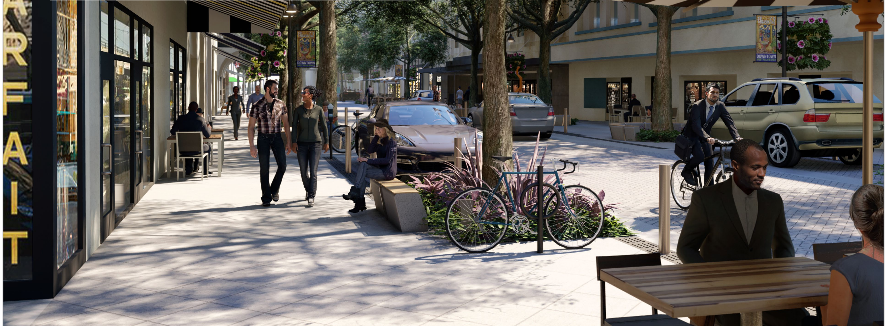
Proposed Design - Widened Sidewalks Allow for More Walkway Width, Dining and Furnishing Areas, as well as Regularly Spaced Shade Trees