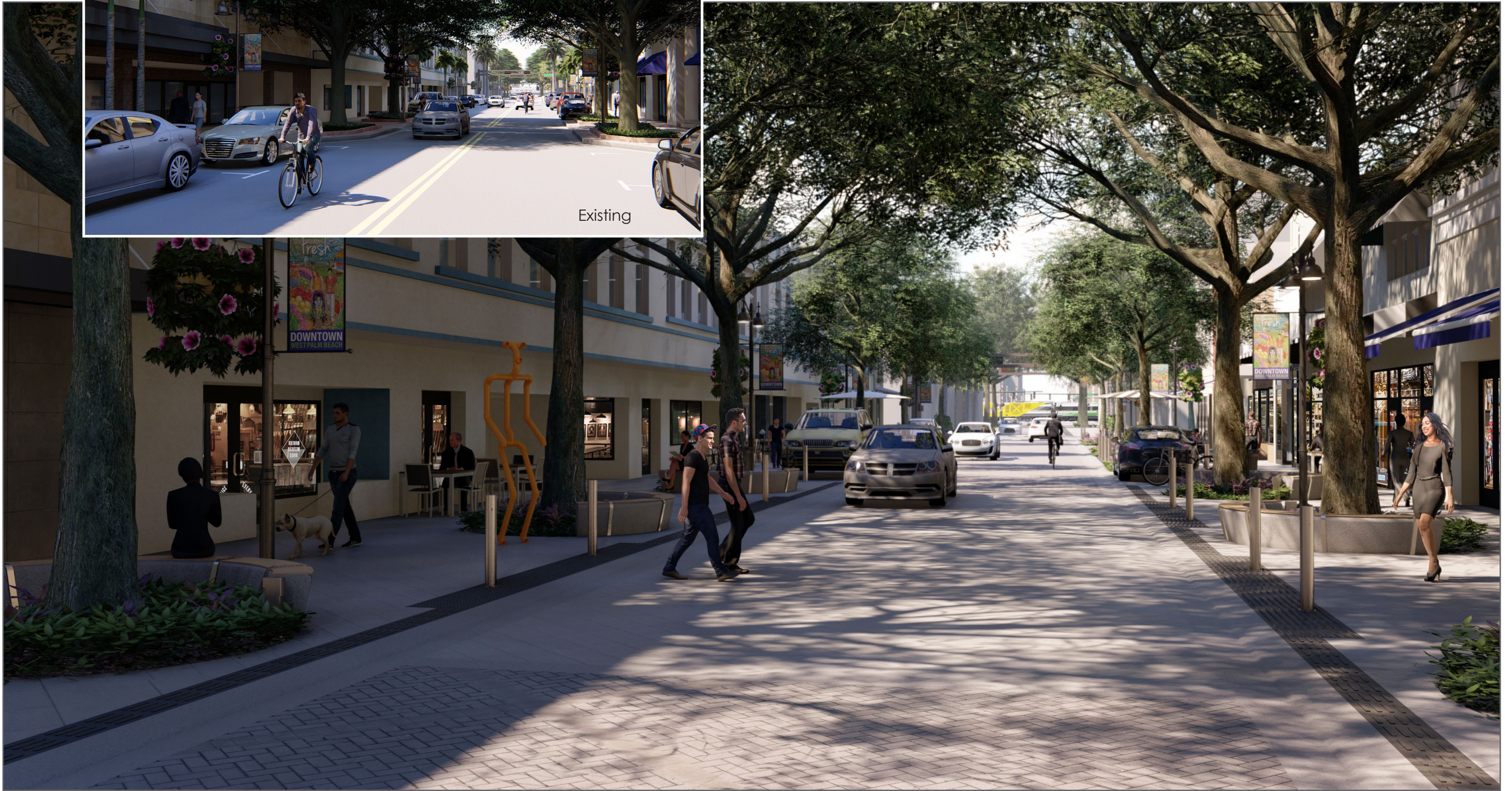
Proposed Design - Mid-Block Crossings are Differentiated by the Continuation of the Sidewalk Paving Pattern