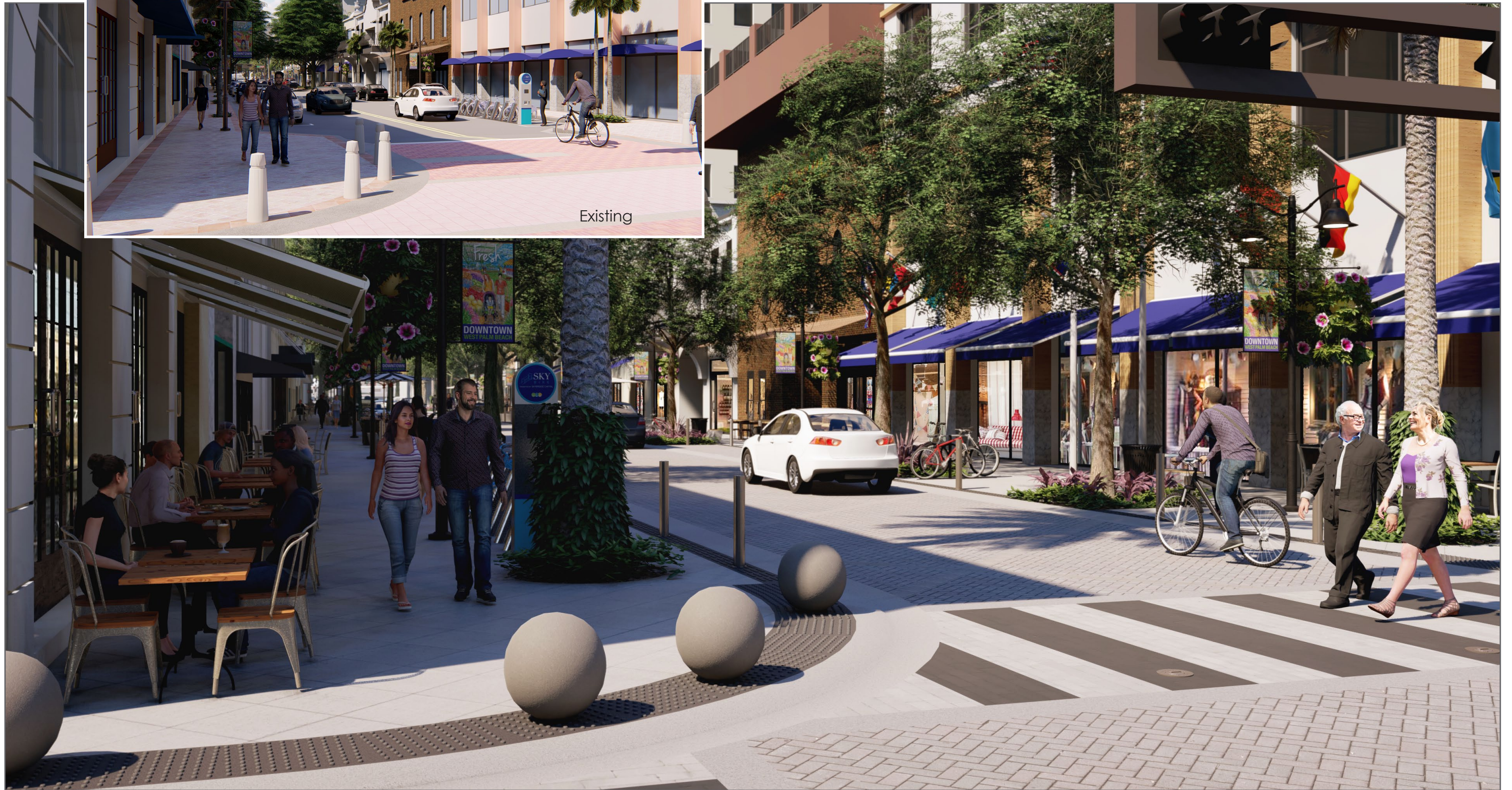
Proposed Design - Patterned Paver Roadway, Valley Gutter, Large Paver Sidewalk, Street Trees with Planting Areas, High-Visibility Crosswalks