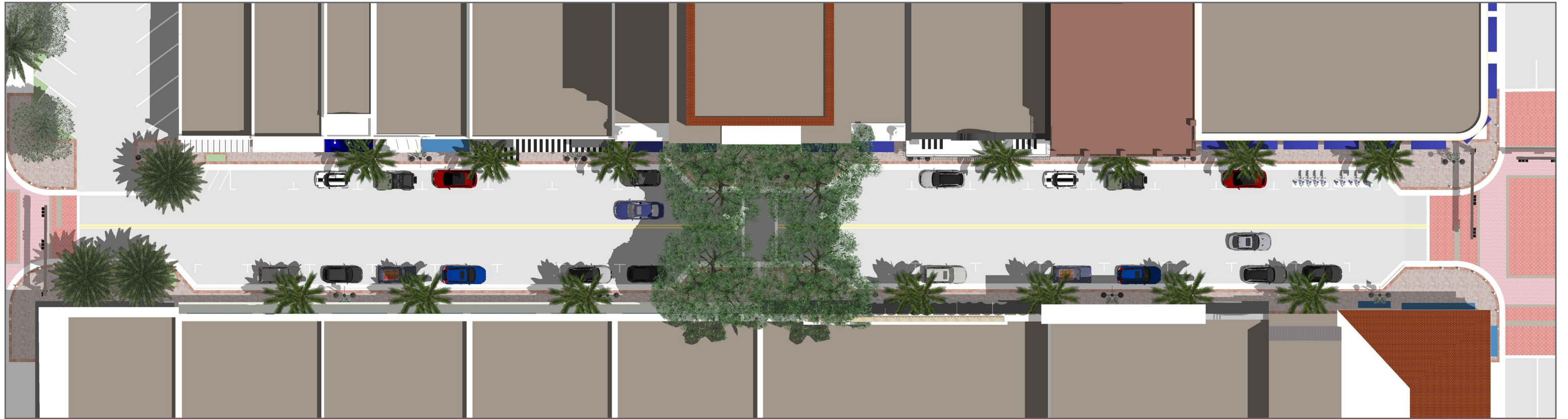
Existing Conditions - 28 Parking Spaces, 4 Live Oak Trees, 14 Palms