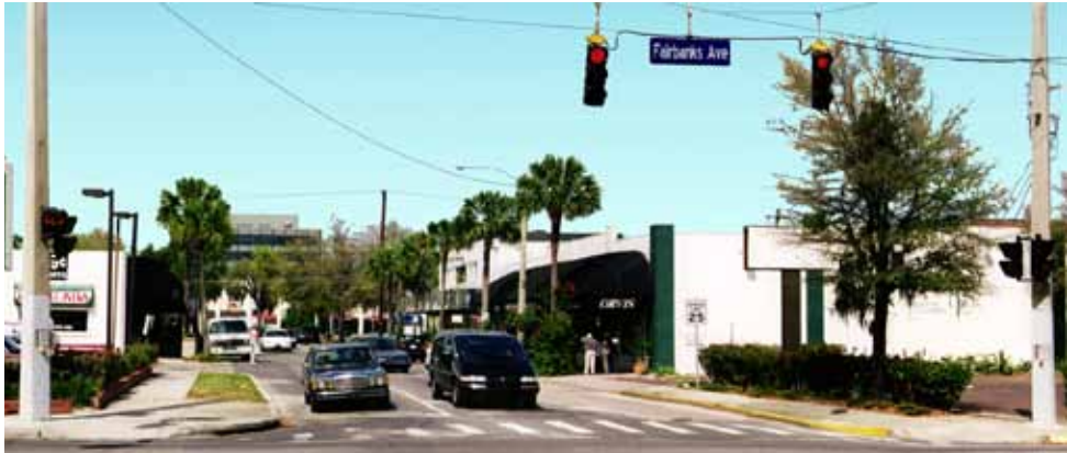
1997 conditions of Park Avenue at Fairbanks Avenue