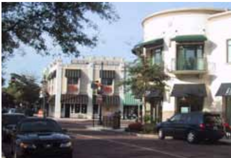
New construction (at right) blends seamlessly with historic buildings along Park Avenue.

For more information, visit doverkohl.com .