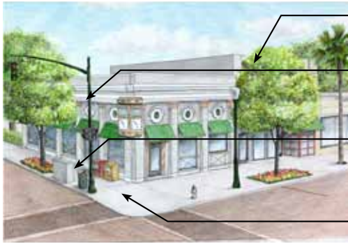
Redesign of Park Avenue