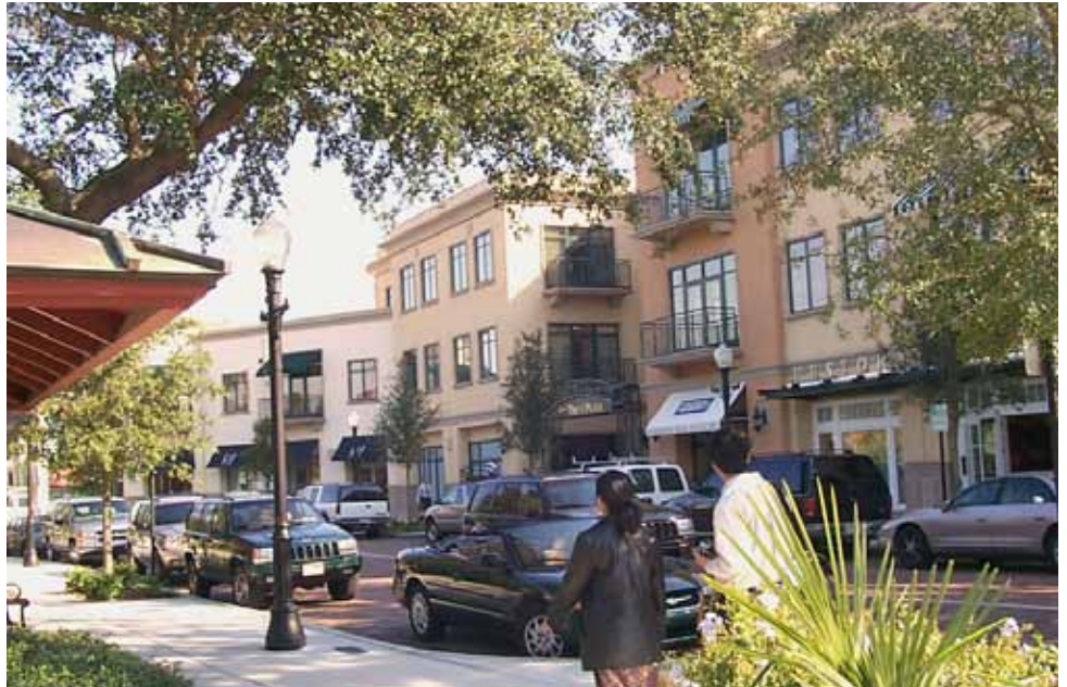
Public improvements and revised regulations, established by the City and Dover, Kohl & Partners, created a new framework for private mixed-use development along Park Avenue.