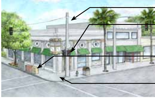
Previous conditions along Park Avenue