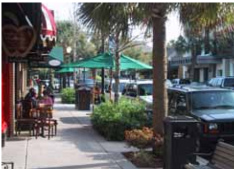
Designed with livability in mind, Park Avenue features sidewalks that are wide enough to be comfortable for pedestrians. This welcoming public space is crucial to restaurant and retail success.

Improvements to Park Avenue have been completed. In 2002, Rollins College constructed a grand main entrance to their campus, located at the terminus of Park Avenue, which further enhances these streetscape improvements. This project, known as the McKean Gateway, and the College's Marshall and Vera Lea Rinker Building (which opened in 2003), were designed by Dover-Kohl's affiliated architecture firm, Chael, Cooper & Associates. Work on both of these architectural projects earned the firm the 2006 Palladio Award for New Design.