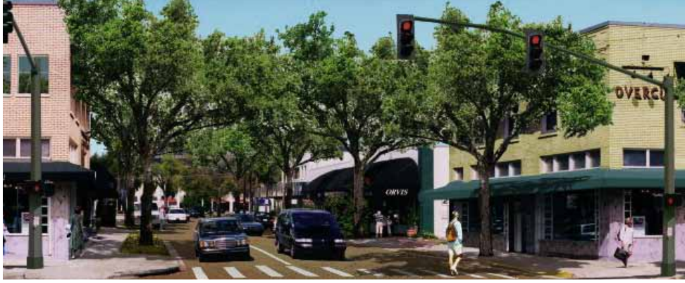
Proposed redesign of Park Avenue at Fairbanks Avenue, with incremental infill completed over time