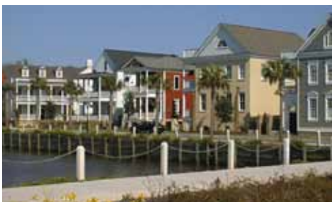
Lowcountry architecture takes advantage of natural breezes