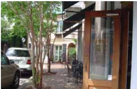
Outdoor dining in the heart of the neighborhood