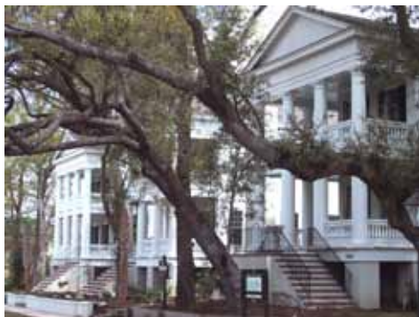
The houses known as “The Three Sisters” share a repetitive, neoclassical building style and are inserted between the site’s existing live oak trees. The result is a mature and stately street scene.

For more information, visit doverkohl.com .