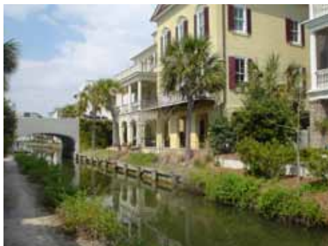
Canals connecting East and West Lakes provide an intimate setting for residences.