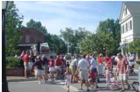
Residents gathering for a holiday celebration