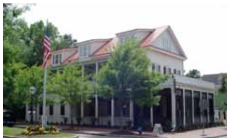
The Inn at I'On and Jacob's Kitchen Restaurant

I'On has won numerous awards for its innovative design, including Best Community in the Nation and Best Smart Growth Neighborhood by Professional Builder magazine and the National Association of Home Builders, as well as a Charter Award from the Congress for the New Urbanism in 2003. I'On was also the site of the 7th Annual LIFE Magazine Dream House and was featured in Bob Vila's Home Again .