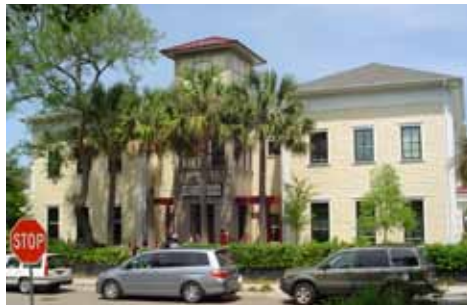
One of two Montessori schools in the neighborhood