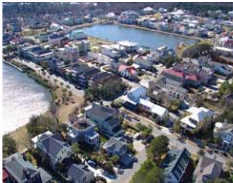
A mix of unit types, including townhomes and single family homes, are included within each neighborhood.