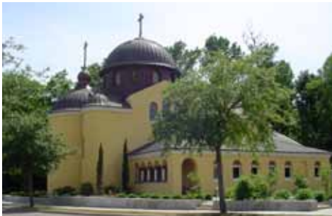
Holy Ascension Orthodox Church