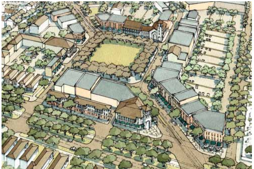
Proposed Town Center

Tree lined streets, wide sidewalks, and homes with doors and windows that front the street help to create a safe, pedestrian-friendly environment.