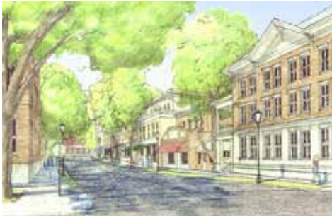
A prominent Downtown intersection is redeveloped.