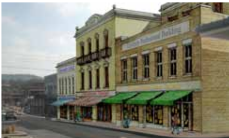
Infill development along Dickson Street completes the street scene.

For more information, visit doverkohl.com .